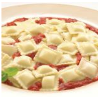
0115 Square Cheese Ravioli 10lb bulk 150 cases/pallet