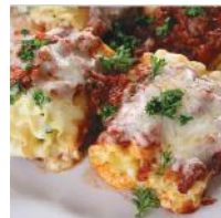
262 Cheese Lasagna Roll-Ups 3.5oz ea (5 trays of 12) 60/3.5oz bags 140 cases/pallet