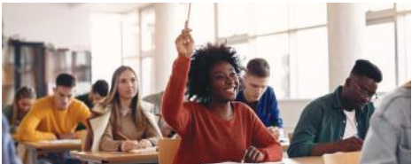
K-12 & HIGHER ED