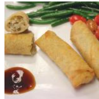
80847 Vegetable Egg Roll 2oz ea 160 count bulk 90 cases/pallet