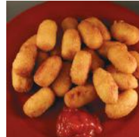
20450 Mini Chicken Corn Dogs .67oz ea 2/5 lb bags 120 cases/pallet