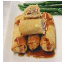
80846 Chicken Egg Roll 2oz ea 160 count bulk 90 cases/pallet