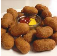
20452 Whole Grain Mini Chicken Corn Dogs .67oz ea 2/5 lb bags 120 cases/pallet