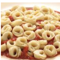
670 Cheese Tortellini 2/5lb bags 150 cases/pallet