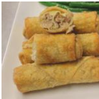
80845 Pork Egg Roll 2oz ea 160 count bulk 90 cases/pallet