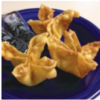
70150 4 Star Crab Rangoon 1 oz ea 4/25 count bags 100 cases/pallet