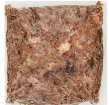
Product in bag